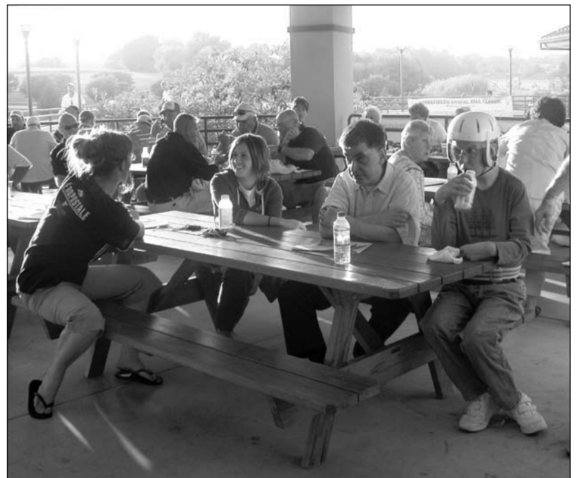
A few residents of Homefields, with staff, bask in the golf club pavilion at our last tournament.

Homefields 150 Letort Road P.O. Box #41 Millersville, PA 17551